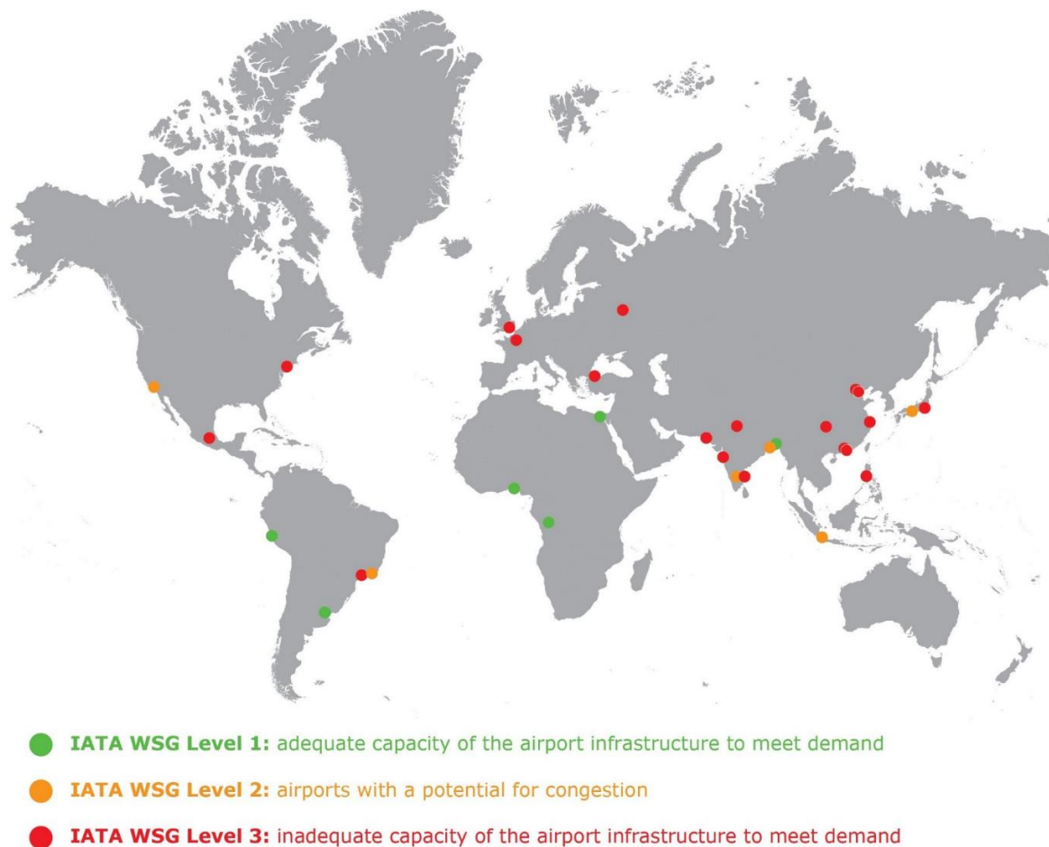
Figure 1. WSG Level 3 congested airports at world’s megacities

Note: A megacity is defined as a metropolitan area with 10 million or more inhabitants (UN, 2016). Source: IATA (2017), Airbus (2016), UN (2016).