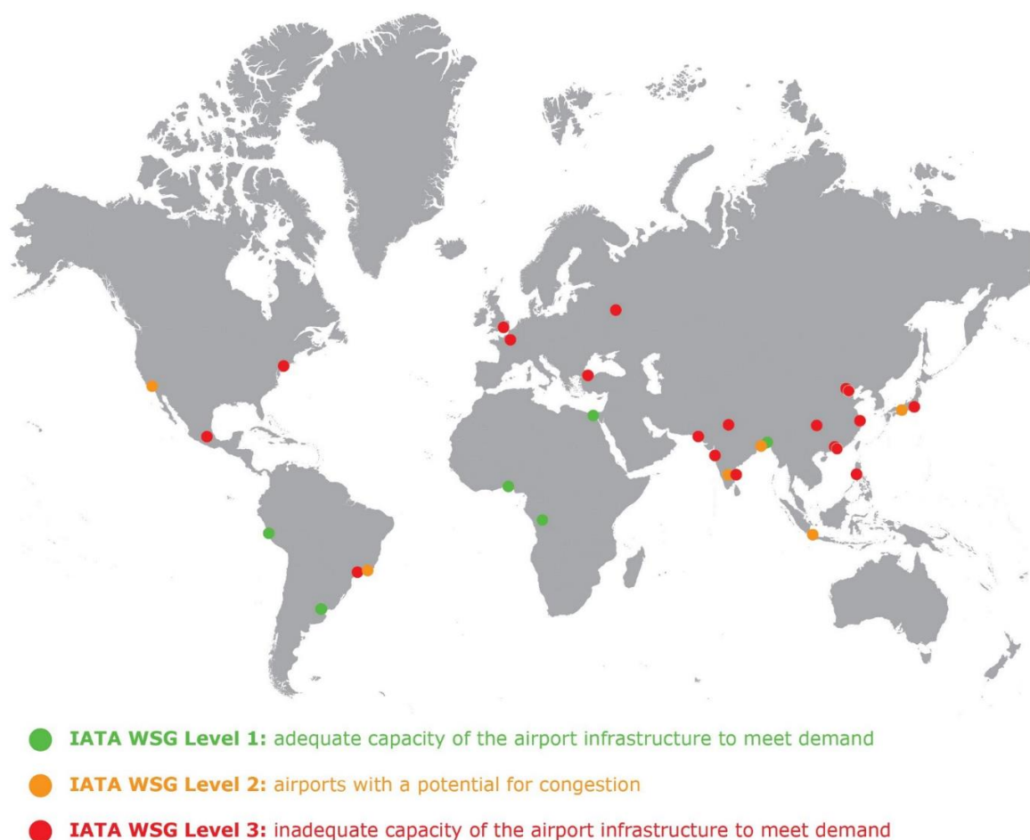
Figure 1. WSG Level 3 congested airports at world's megacities

Note: A megacity is defined as a metropolitan area with 10 million or more inhabitants (UN, 2016).