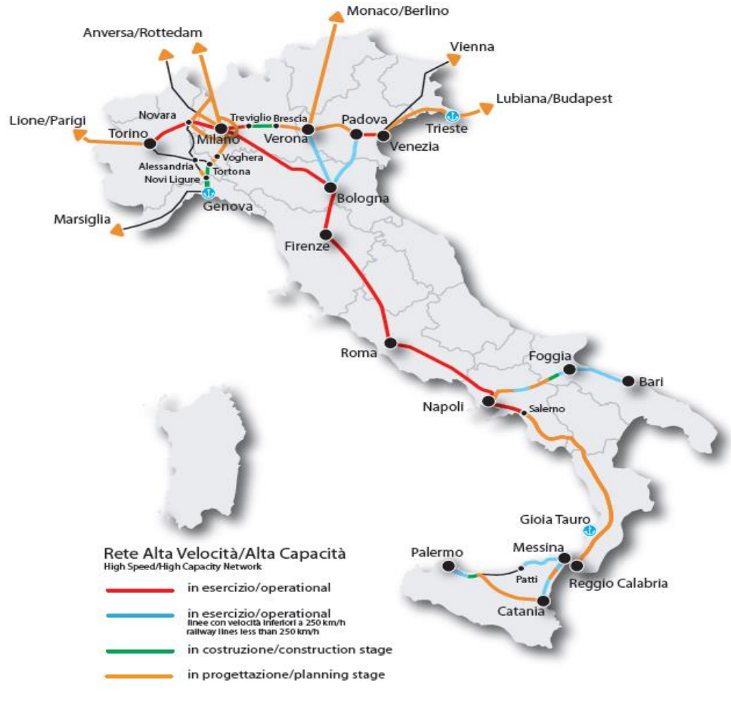
Figure 3. Italian High Speed railway network