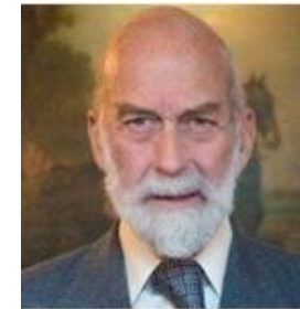
Prince Michael of Kent

Secretary General International Civil Aviation Organization