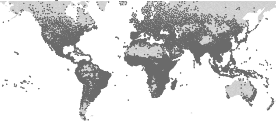
Figure 4. Domestic freight centroids

As is the case with international freight centroids, the influence area of each domestic freight centroid is computed based on a raster world surface map. Population and GDP estimates are linked to each centroid while again respecting country boundaries (each raster cell is assigned to a centroid that lies in the same country as the raster cell, based on its distance to the centroid). Figure 3 provides an overview of the domestic freight centroids that have been defined in ITF's freight model.