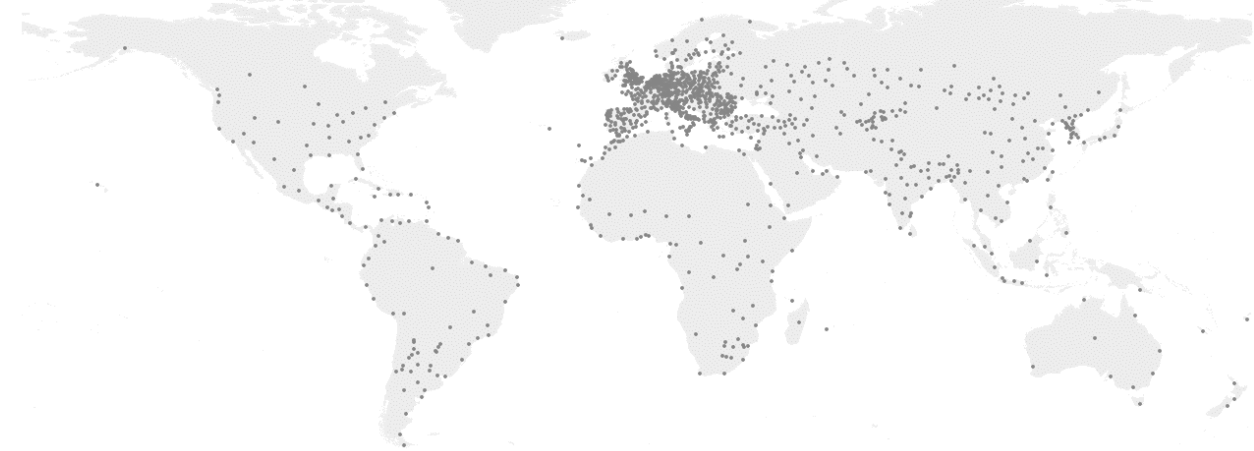
Figure 3. International freight centroids

An adapted set coverage algorithm was implemented to identify centroids based on a larger set of potential centroids. These potential centroids are all global cities with a population of fewer than 300 000 people, as identified by the United Nations in 2010 (2 539 cities) (UN, 2015). The objective function minimises the number of centroids under the constraints that only one centroid can exist within a 500km radius (in the same country), while the total of the globe's land surface has to be attributed to a centroid.