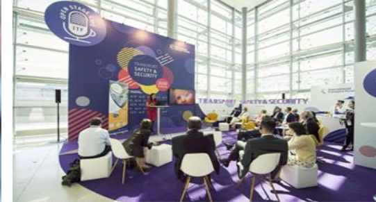
Open Stage Cafe