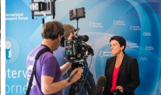
Media interviews & events