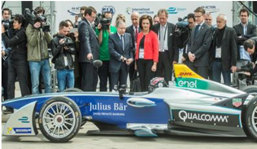
Sponsorship, exhibition and live demos