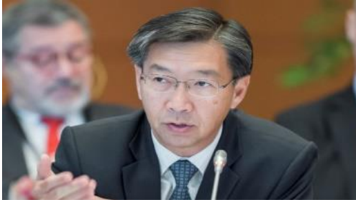
CEOs addressing Ministers