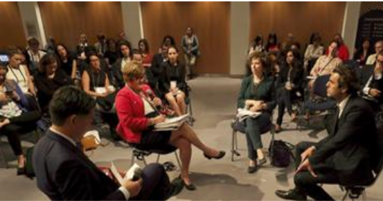
Diversity of sessions